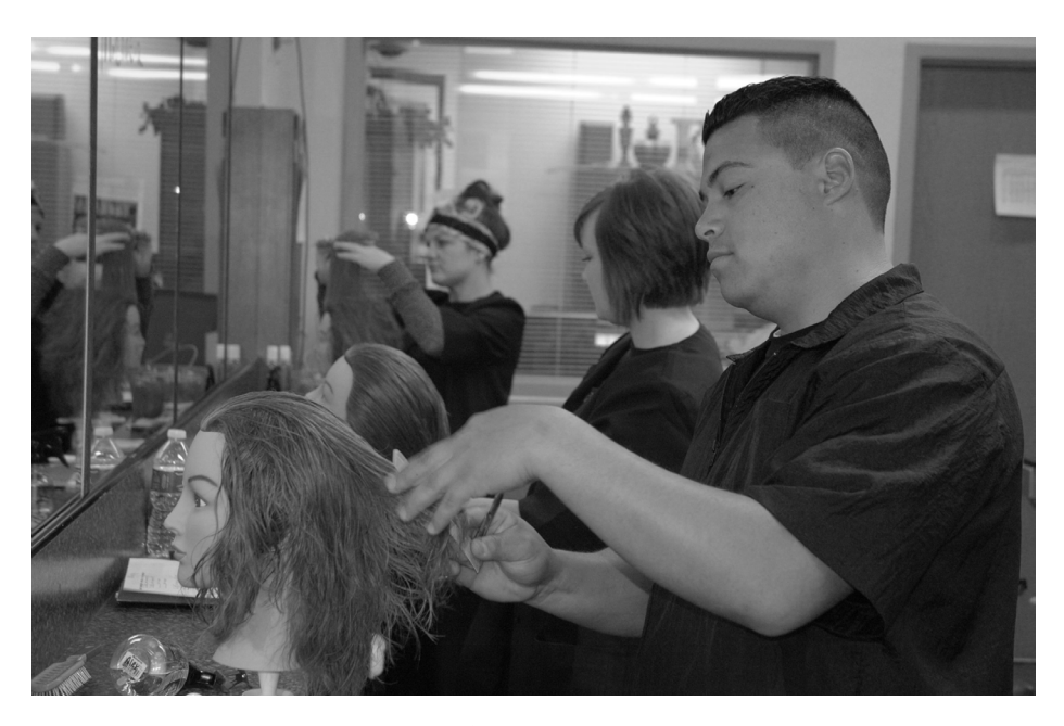
Vernon College Cosmetology students work on the latest hair trends during class time. Vernon College offers the cosmetology program on the Vernon Campus and at the Century City Center in Wichita Falls.