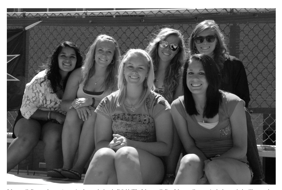
Vernon College students enjoy a nice day at the baseball field. The Vernon College-Vernon Campus is the home of the Chaparral and Lady Chaparral baseball, volleyball, rodeo and softball teams.