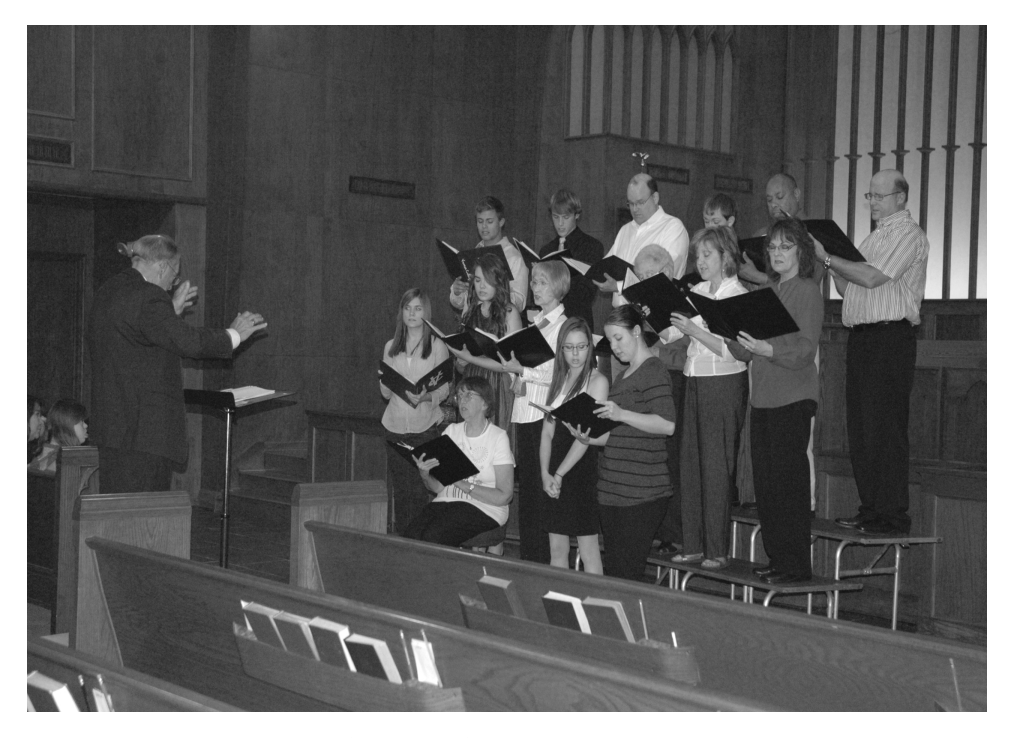
Members of the Chaparral Singers along with Community Chorus members perform at their Fall Concert. Vernon College offers Fine Arts classes in music and drama each semester.

The College reserves the right to withdraw a student from one or more classes if, in the judgment of college officials, such action is deemed to be in the best interest of the student and/or the College. Examples of some reasons for administrative withdrawal are failure to pay registration tuition and fees, failure to provide admission credentials or meet course prerequisites, failure to follow Vernon College TSI policy, failure to remove "holds" in a timely manner, failure to comply with Title IV financial aid requirements, excessive absenteeism, and academic dishonesty.