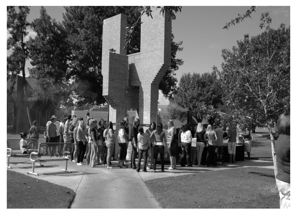
Vernon College celebrated its 40th Anniversary this past year with a cookout for students, employees, and community members.

Students who enter an institution of higher education in the fall 1997 semester or later may be eligible for up to a $1,000 tuition rebate as authorized by Section 54.0065 of the Texas Education Code. Eligible students must be pursuing their first baccalaureate degree from a Texas public university, must have been a resident of Texas, must have attempted all course work at a Texas public institution of higher education, and must and attempted no more than three (3) hours in excess of the minimum number of semester credit hours required to complete the degree.